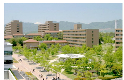
Higashi-Hiroshima campus (Hiroshima University)

For international students, please contact student Support Office at info@thunderbird-tokyo.jp .