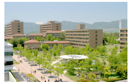
Higashi-Hiroshima campus (Hiroshima University)

For international students, please contact student Support Office at info@thunderbird-tokyo.jp .